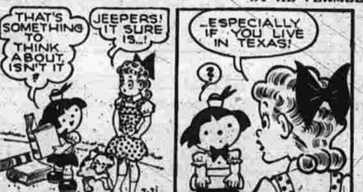
Look Out Below