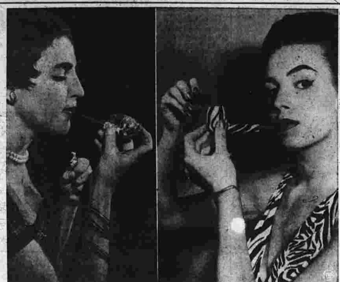
If pipe smoking among women continues to grow in popularity, scenes like this will be no novelty on New York City streets...