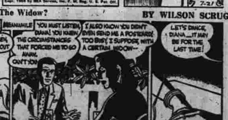
Oh! The Widow?