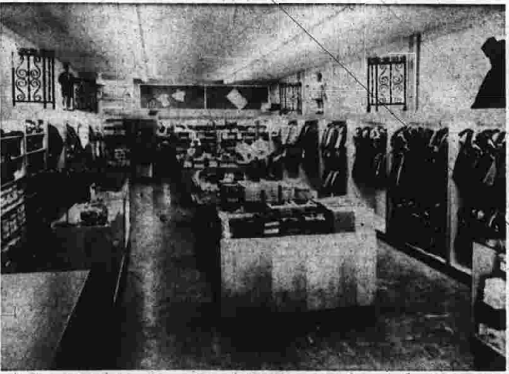
Pictured above is the interior view of our new store. New counters and new fixtures lend to make our store the most modern in Manchester.