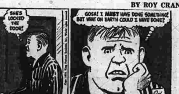
GOYI! I AMBYE YOU ROY CRANE