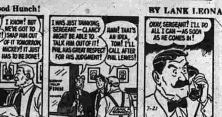
A Good Hunch!